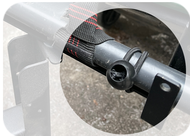
Ball Hold Down

We also offer Ball Hold Down Straps and Quick Release Pins that are easy to apply if the PTOs are hard to use.