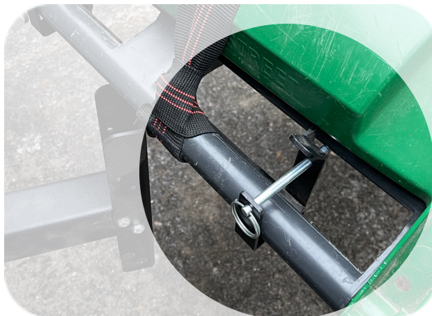
Quick Release Pin or Lasso Kit